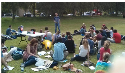
Post-scavenger-hunt outdoor talk