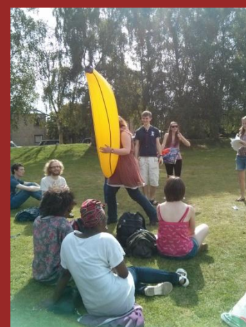
A giant inflatable banana (scavenger hunt 3 rd prize)