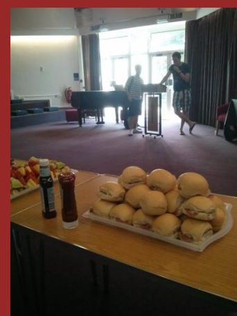
Bacon rolls at Brunchbar